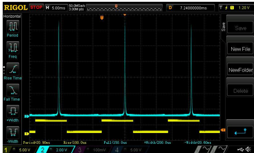
Linewidth measurement using Fabry-Perrot Interferometer