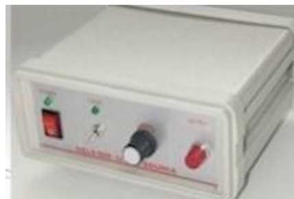
OELAS-LRS Turn Key