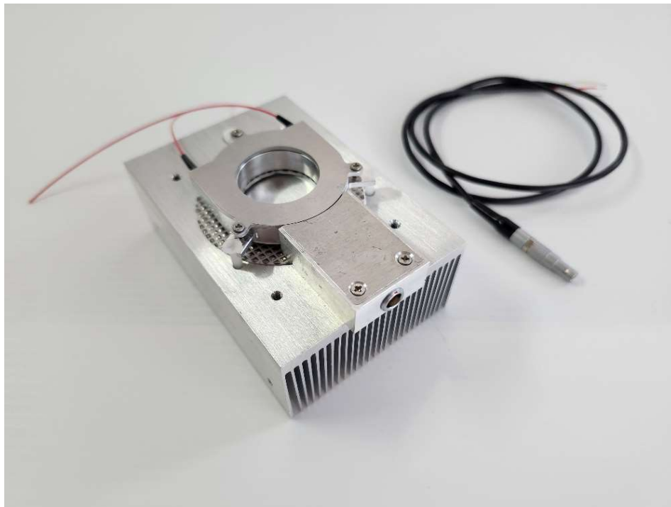
Fig. 1. OETFG-300 Thermo-Tunable FBG Filter (OEM)