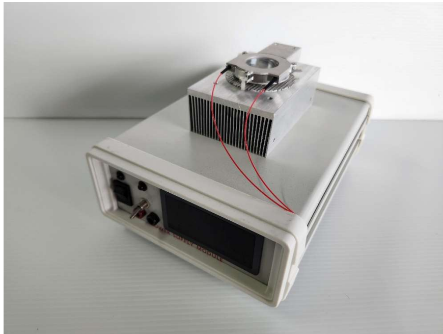
Fig. 3. OETFG-300T Thermo-Tunable FBG Filter (turn-key)